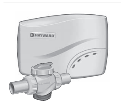
Salt & Swim C